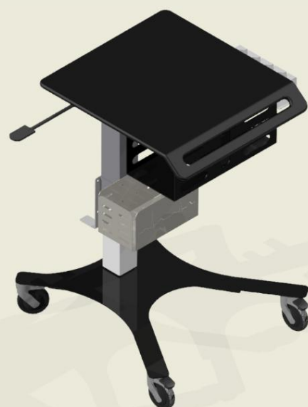
Dimensions of the structure