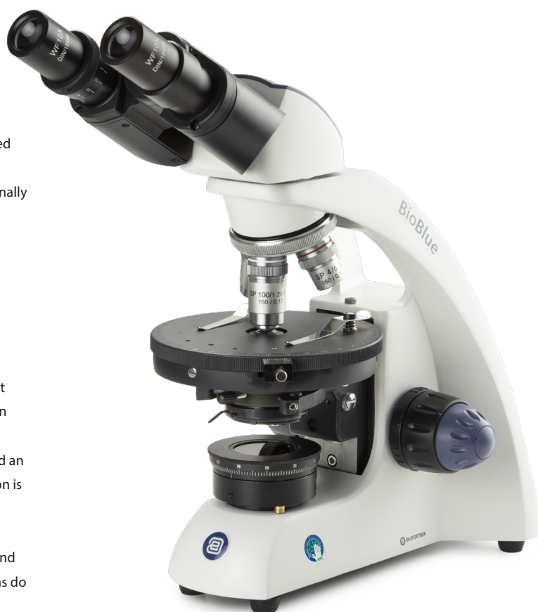
● Polarization model BB.4260-P-HLED

Using the same technology already used extensively throughout the healthcare environment in wall coatings, patient lighting, air pressure stabilization and suction liners, APL prevents the growth of unwanted microbes that can cause degradation, discoloration, staining or odors of the Euromex microscopes