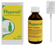
100 ml Gel Dispenser (with spray nozzle) Ref. 100100SPO