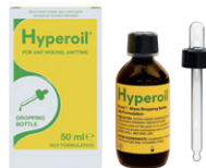
50 ml Glass Dropping Bottle (with dropper) Ref. 10050CGO