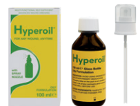
100 ml Glass Bottle (with spray nozzle) Ref. 100610